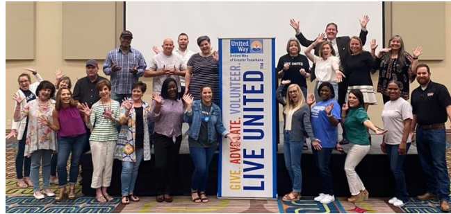
United Way of Greater Texarkana's Community Impact Committee during grant presentations

Because great things happen when we LIVE UNITED